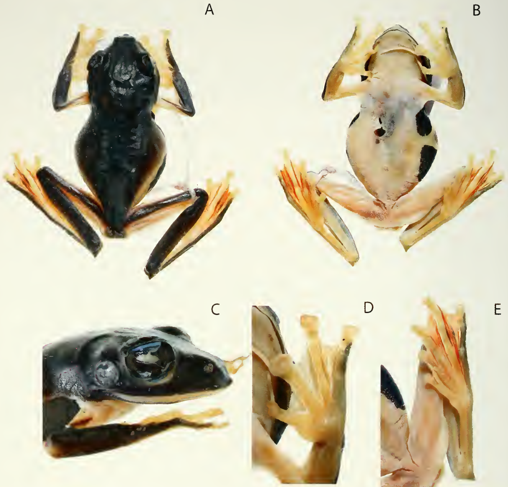
FIGURE 1. (A) Dorsal and (B) ventral views of the body. (C) lateral view of the head, and ventral views of the (D) left hand and (E) left foot of the holotype of Rhacophorus hutwini sp. nov. (CAS 229893).

small supernumerary tubercles in a row between proximal tubercle and base of hand on fingers two, three, and four, respectively; left hand with less obvious supernumerary tubercles; thenar tubercle low, extends medially at base of first finger, palmar tubercle absent. Thick dermal flange extends from lateral base of fourth finger to elbow, at widest approximately 18% of width of forearm.